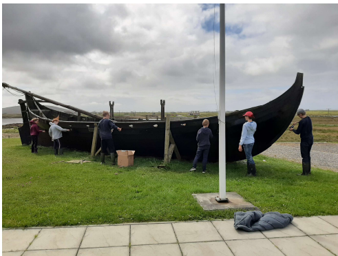
The galley being oiled by volunteers, 2022.

As a second stage, the trust is keen to expand the galley house into a larger Maritime Museum Centre. This topic has limited coverage on the west coast of Scotland in general – and where better to portray the maritime history than the Hebrides.