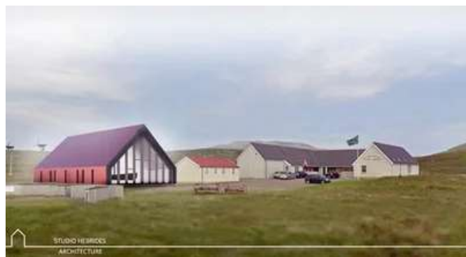
The proposed new building at Kildonan Museum.

For more information and to donate to the project, please visit: www.galleyaileach.co.uk