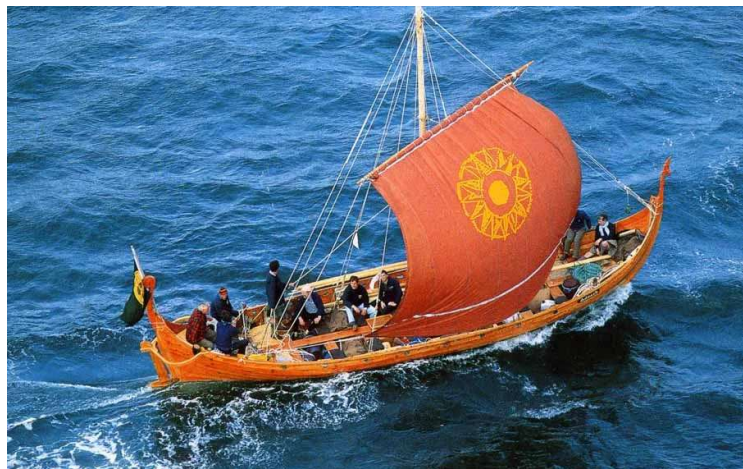
Crossing the Minch, 1992